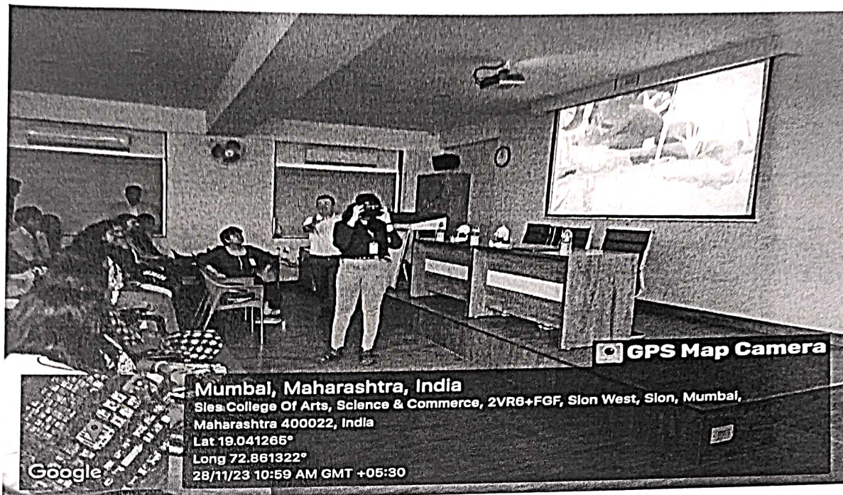
Figure 4 Student Experiencing VR SET